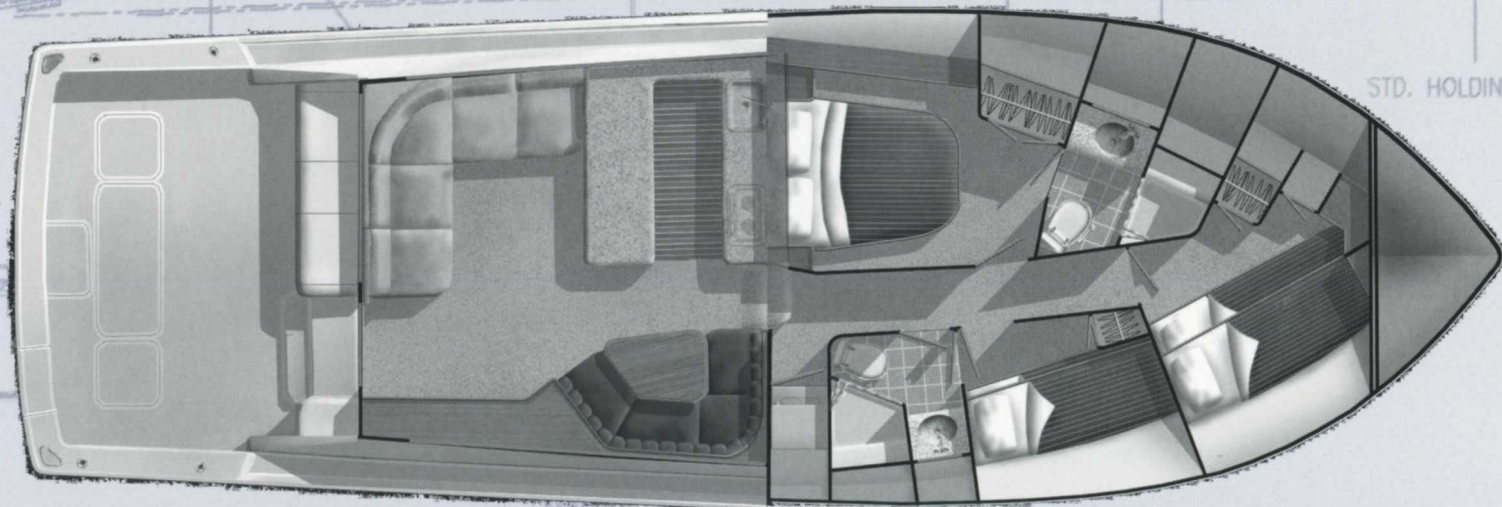
3 Stateroom Layout