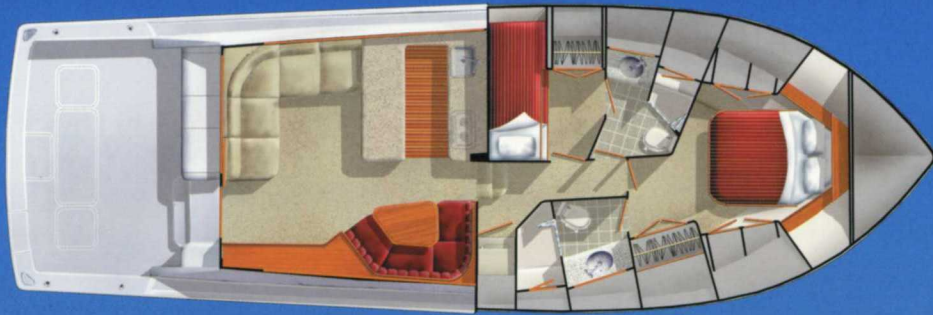
2 Stateroom Layout