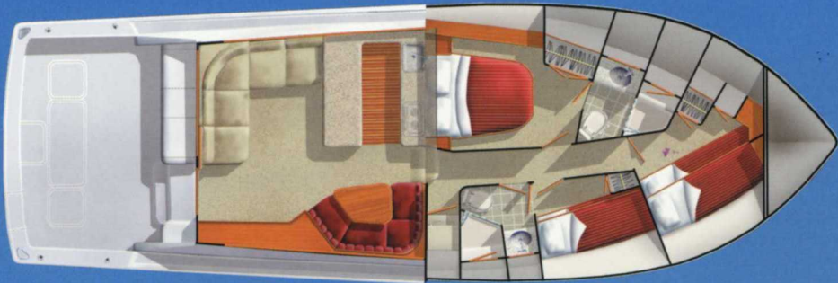
3 Stateroom Layout