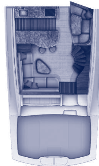
Enclosed Bridge Salon