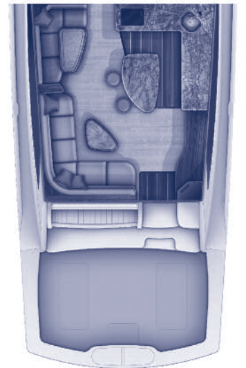
Open Bridge Salon

Route 9 "On the Bass River" P.O. Box 308 New Gretna, NJ 08224